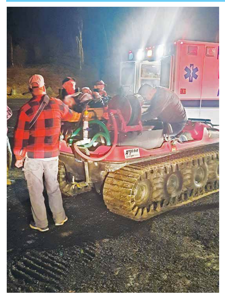
Rescuers transfer the woman from the Argo to the Petersburgh Ambulance Tuesday evening, following a medical incident on a trail near the famous snow hole near the tri-state border on the top of the Petersburgh Pass.