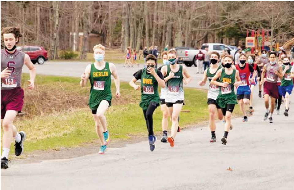
The Berlin-New Lebanon Boys Cross Country team starts the race in a pack, also at GLSP on Tuesday.