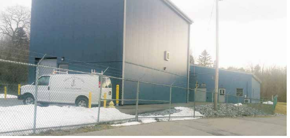
The Village of Hoosick Falls Water Treatment Plant.

The two pop-ups this week saw walkins accepted, quite a change from when the vaccines were first rolled out, when getting an appointment for a shot was nearly impossible. Since then, more vaccines are available and the country has experienced more people than anticipated opting not to be vaccinated. So much so, there is a national advertising campaign underway