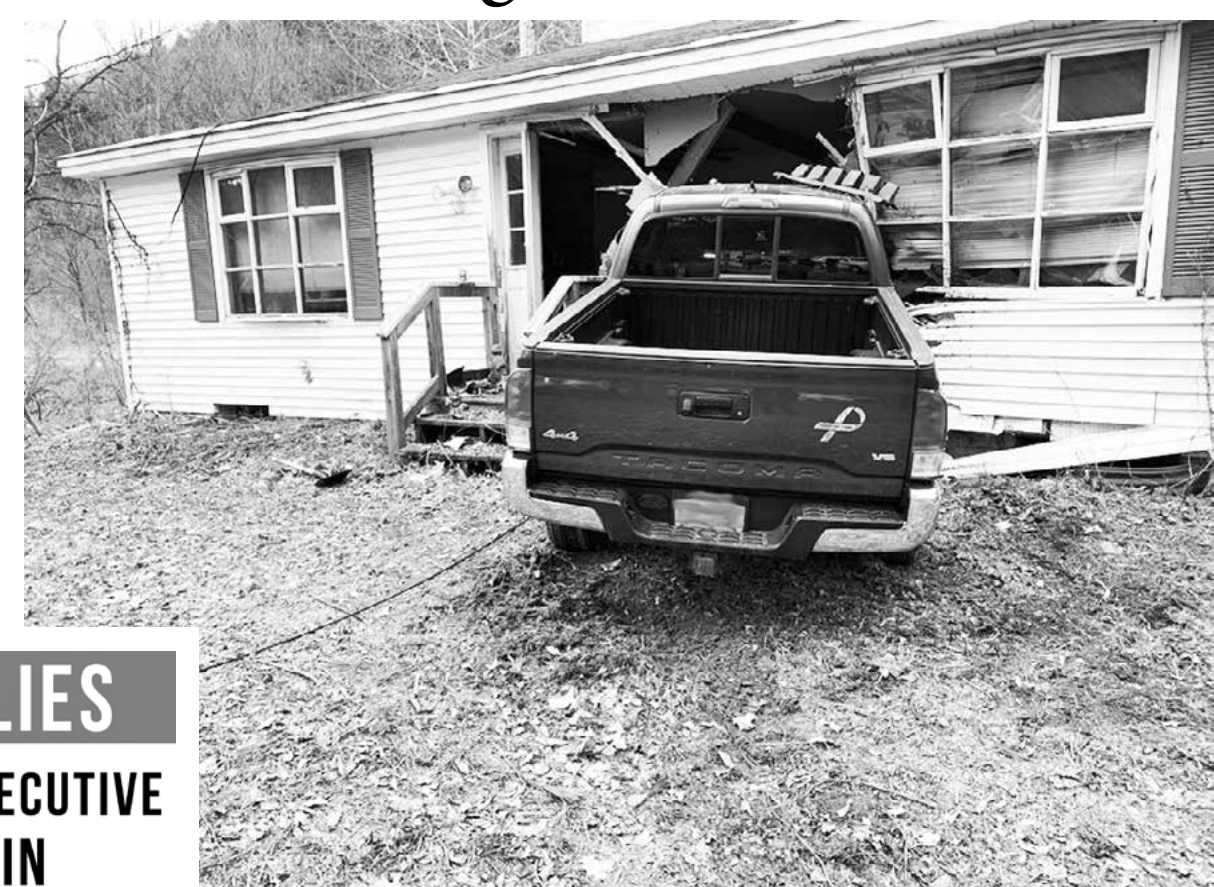
The driver of a truck traveling NYS Route 2 lost control and ended up crashing through the brush and into this home in Petersburgh on Friday, April 2. According to reports, there was no one in the home at the time of the mishap. The driver of the truck was transported to a local hospital by ambulance for treatment of a undisclosed condition. The cause is under investigation.