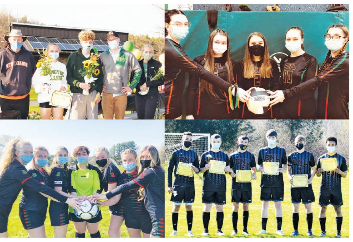
A collage of some of the Senior Days recognitions that have taken place during the last week for Berlin-New Lebanon sports programs.

Planning/Ethics Board Member Removed In New Lebanon Story on Page 7