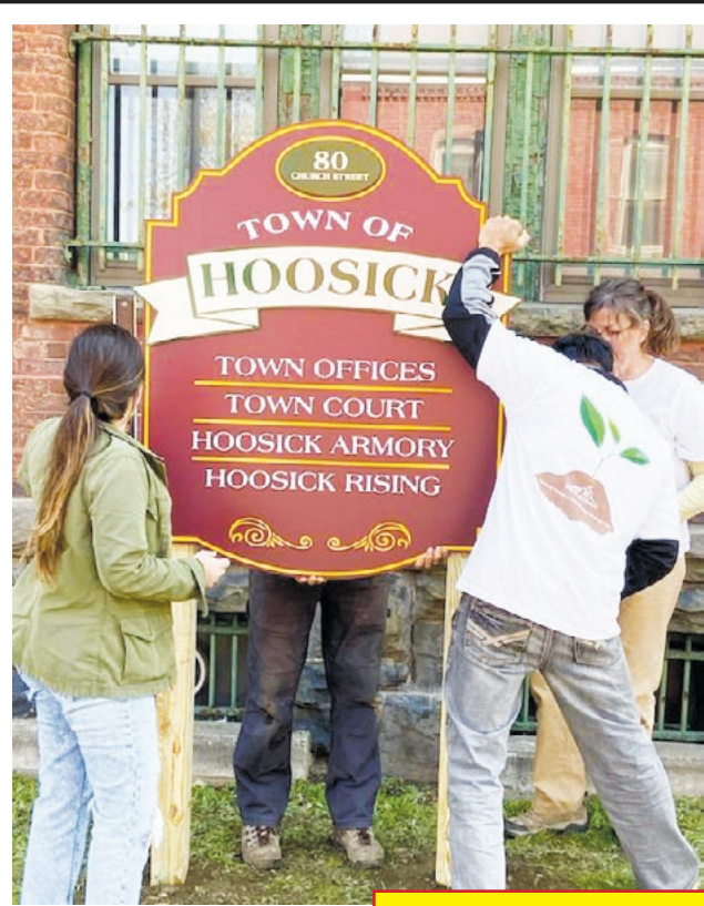
Saint-Gobain Volunteers help erect the new sign in front of the Armory.

The logistics of this merger were difficult enough to work out, without Continued on page 6