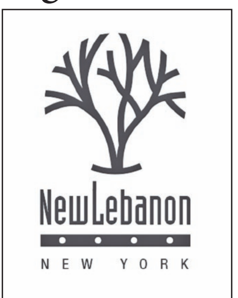
New Lebanon's newly approved town logo.

Attorneys for New Lebanon and those offering