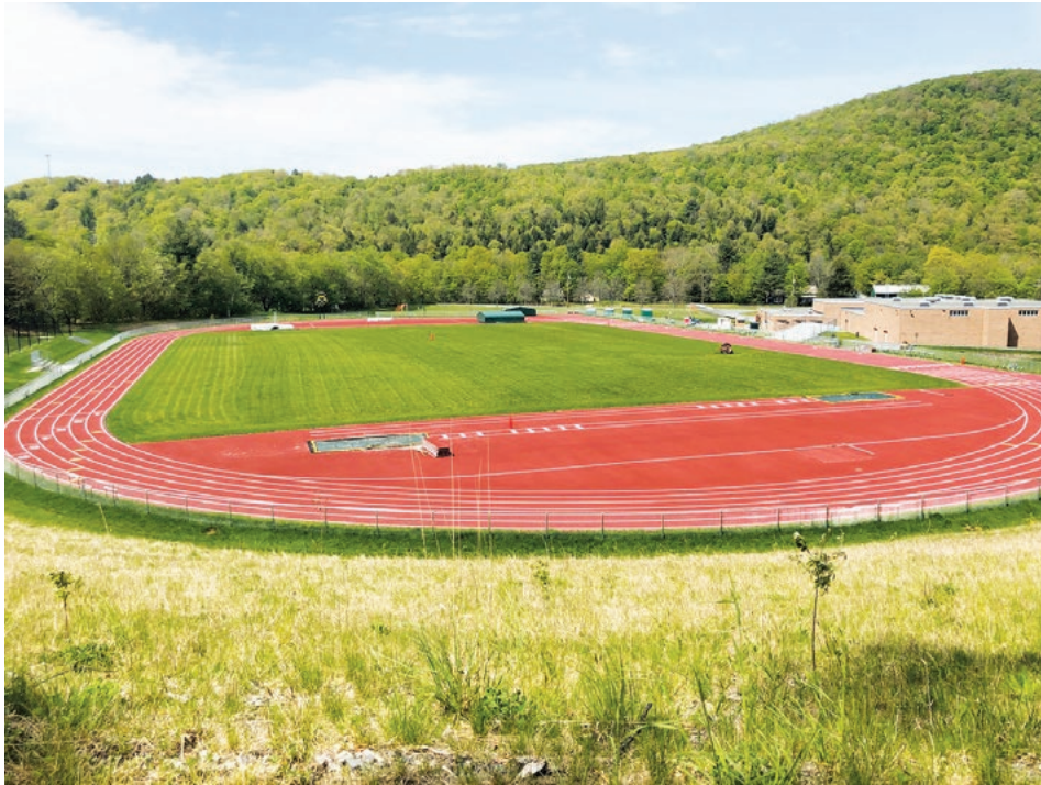
A look at the new Berlin CSD track.

The Berlin Central School District hosted their first home Track and Field meet on Tuesday, May 18.