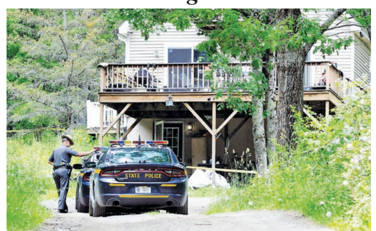
NYS Police outside the home at 151 Jay Herrington Road, where a young man was murdered during an apparent home invasion early Wednesday morning.

Troopers describe the investigation as active and say preliminary information suggests this was the NYS Police tip line at 1-800-448-3847 or a targeted shooting and that the parties involved knew one <u>crimetip@troopers.ny.gov</u>. another. There is not believed to be an ongoing threat to the community. State police are asking anyone who may about this and will post additional information have information regarding this investigation to contact on our Facebook and website.