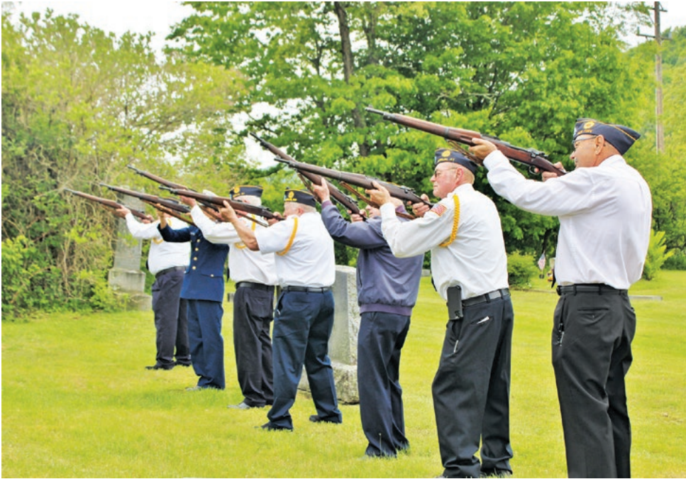
Members of American Legion Post 937 in Berlin fire a 21 gun salute at the Southeast Hollow Road Cemetery on Memorial Day.

Like most communities in Rensselaer County, there were remembrances and tribute paid to our fallen soldiers in Petersburg, Berlin and Stephentown. Berlin American Legion Post 937 started out the most solemn of American holidays with ceremonies at the Pleasant Valley/Meadowlawn Cemetery in Petersburg honoring our fallen warriors laid to rest there. Next came a small parade to the World War I and II Monument in Berlin for prayers and raising of the American Flag. On Memorial Day, it flies at half staff until noon, when it is then raised to full staff until sundown. This tradition honors those who gave their lives in the morning, and all living vet-