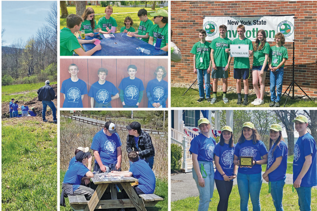
A collage of pictures from this year's Envirothon competition, including the Berlin Green team, who won the 2022 Rensselaer County Envirothon Championship.

This year Berlin Middle/High School sent two teams from the high school and one from the middle school to the Regional Envirothon Competition. The students competed to test their knowledge of soils, forestry, wildlife, aquatics and current environmental issues and were tasked with creating a presentation that solves a current issue.