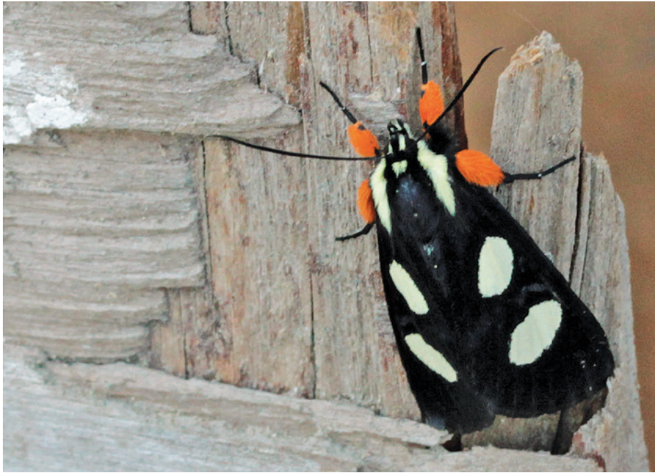
The Eight-spotted Forester Moth ( Alypia octomaculata ) flies during the day between April and June in the northern U.S. and for a longer period in the south. Not seen here are the four large spots on its underwings. The moth is usually a little more than an inch long. Photographed by Trix Niernberger near the woods of Petersburg.