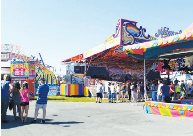
A previous year's event.

This year's version of the Great Schaghticoke Fair will run from August 31 through Labor Day, September 5 , with everyone allowed into the grounds for one dollar (Dollar Day) when the gates open on August 31. This is also Military Appreciation Day — veterans and active duty military get in free with a military ID. Other Dollar Day specials include $1 rides when you buy 10 tickets and some $1 food items. Dollar Day is sponsored by Rensselaer County in honor of all First Responders.