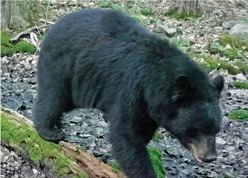
American Black Bears ( Ursus americanus ) live in our area forests. Their average lifespan in the wild is 18 years. In summer, they like to eat berries and insects such as bees and ants. This one was photographed last week by Trix Niernberger's trail camera in the deep woods of Petersburg.