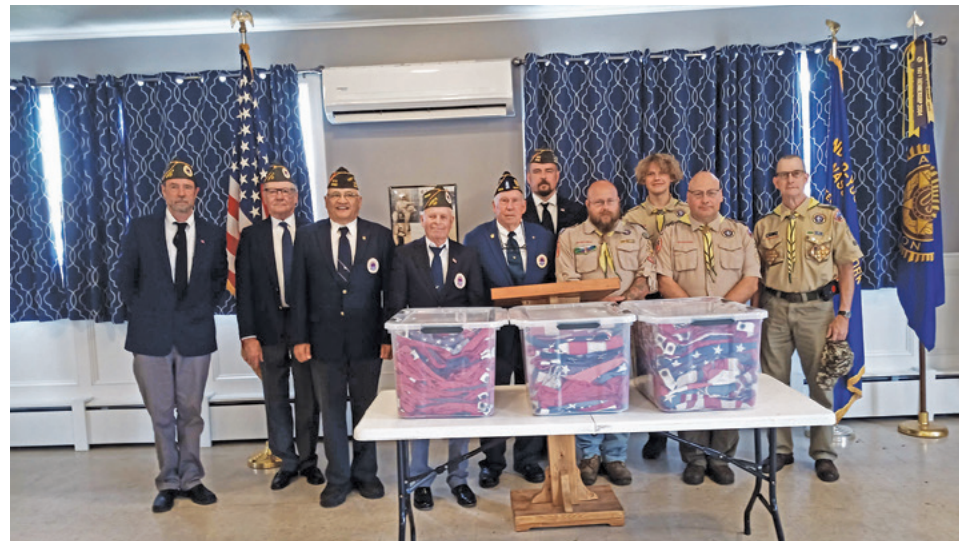
On Sunday, June 12, members of AMVETS 797, VFW 8162, American Legion 1268 and Scout Troop 166 held a flag ceremony at the Chandler Young Association building in Nassau. Local officials and residents joined in the ceremony to retire several flags and pay tribute to service members.