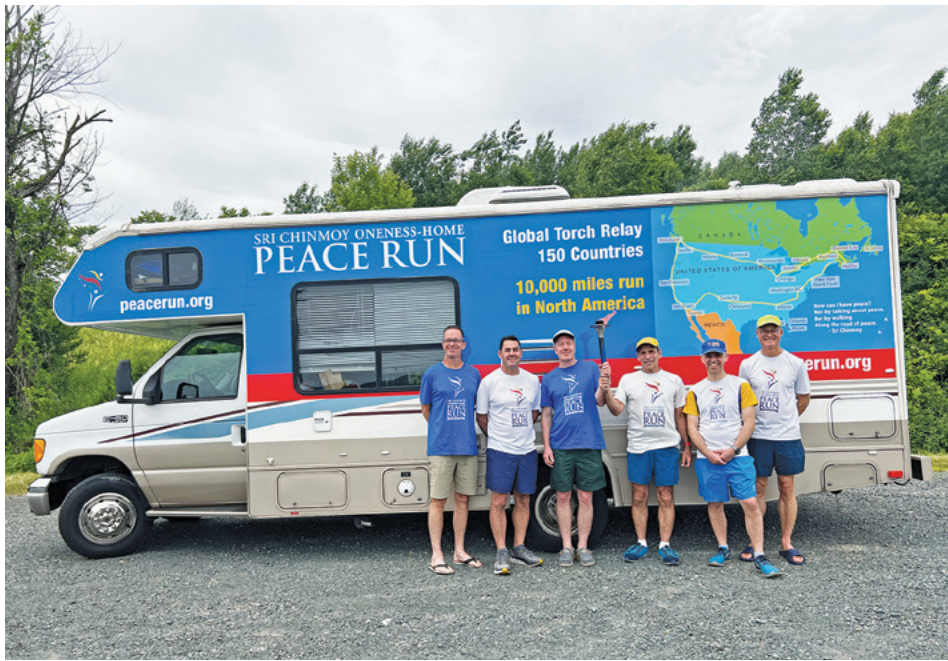
Some of the participants in the run for peace and love for the Sri Chinmoy Oneness-Home Peace Run in Clums Corners. Their van was stationed at the pull over area at the intersection of Routes 278 & 2.

Please Send Graduating Seniors' Photos and Future Plans