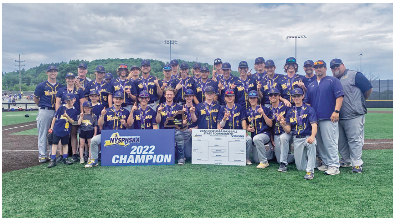
Congratulations to Averill Park, who defeated Hamburg 3-0 in the NYS PHSAA Class A Championship game on Saturday, June 11 to claim the first baseball state title in school history.