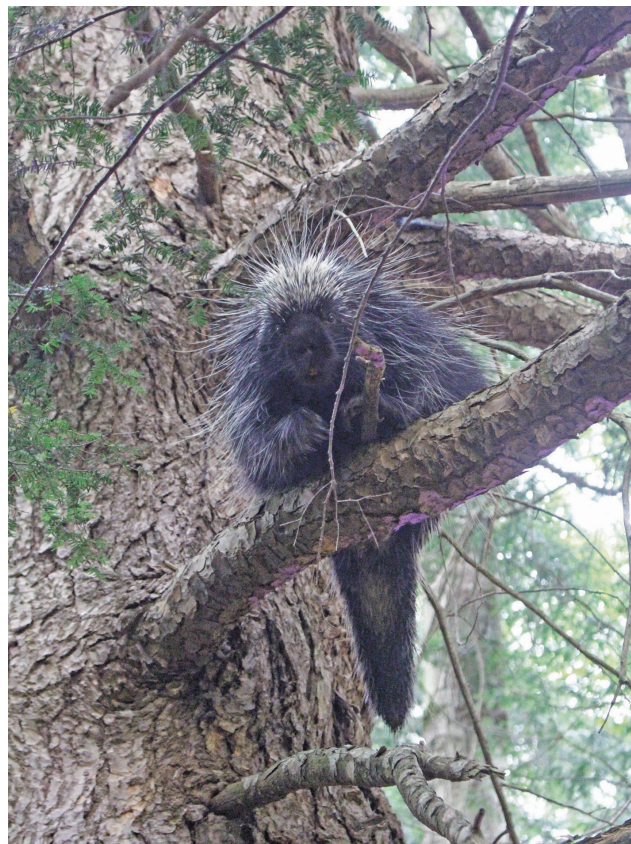
A porcupine calmly hanging out in a tree, listening to Off The Record at Dyken Pond Environmental Educational Center on Saturday, August 20.

For more information, visit www.brunswicklibrary.org .