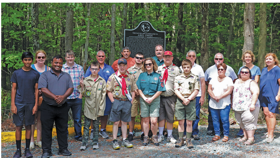
Berlin Central School District members, volunteers, and members of Scout Troop 222 of Grafton, standing in front of the newly named Abel Owen Trail, dedicated on August 21.

Bennington: 7 Berlin: 2 Brunswick: 4, 5 Cambridge: 6, 7 Church News: 15 Comm. Calendar: 14 Crossword/Sudoku: 14 Grafton: 4, 5 Hoosick: 6, 7 New Lebanon: 8 Obituary: 15 Petersburgh: 2, 3 Pittstown: 6 Poestenkill: 4 Public Notices: 11-13 RensCo News: 9 Sand Lake: 5 Senior News: 13 Sports: 10, 13 Stephentown: 2 Student Honors: 13 Trix Nature Photo: 16