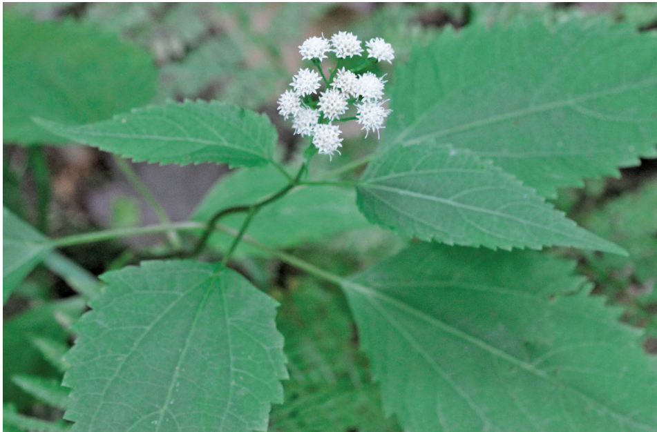
White Snakeroot ( Ageratina altissima ) is a native perennial herb that grows up to five feet tall and is blooming now in area woods and shaded areas. The plant contains the toxin tremetol that is poisonous to cows, horses, goats, and sheep. When humans consume milk or meat containing the toxin, the poison can be transferred. in Petersburg.