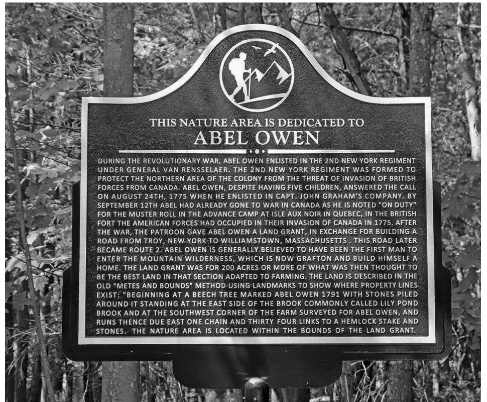
The dedication tablet at the head of the newly named Abel Owen Trail.