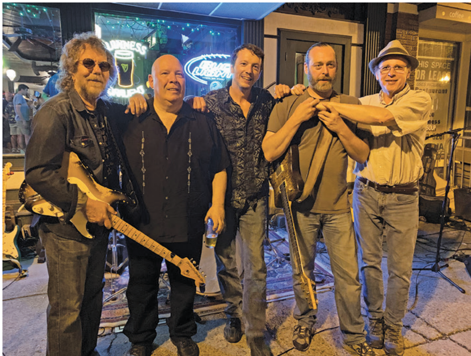
Soul Sky, who will be performing at Wood Park in Hoosick Falls on Saturday, August 6.

Besides playing concerts, clubs and festivals, they