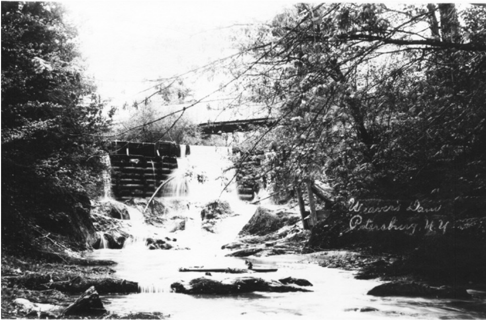
Two photos from the 1920s of B. Weaver's Sawmill Dam in Petersburg – Water Power for Sawmill.