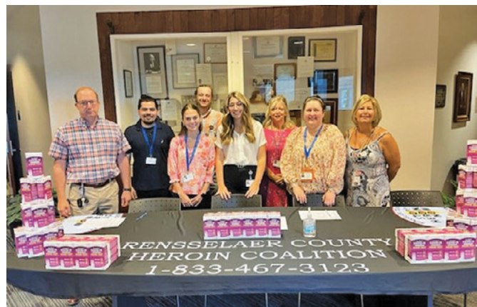
Members of the Rensselaer County Heroin Coalition.