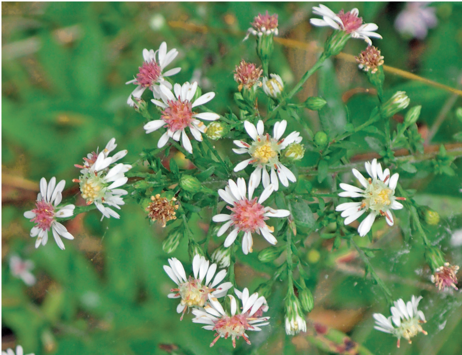
Calico Aster ( Symphotrichum lateriflorum ) is native to eastern and middle North America moist soils, grows to four feet, and appears bushy. The flowers are smaller than most asters and have yellow centers that become pink or brown when mature. Many pollinators appreciate this fall flower. Photo from a Petersburg yard by Trix Niernberger.