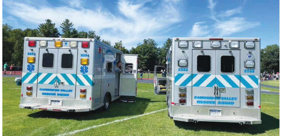
Pictured here are two of the five ambulances operated by the Cambridge Valley Rescue Squad, whose administrator recently spoke to the Brunswick Town Council about options they may have to help solve the Town's ambulance response time problem.