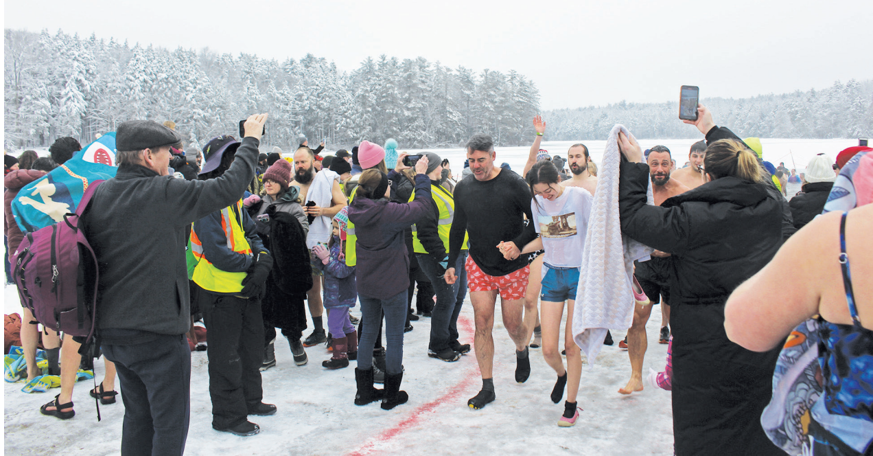
The 2023 polar plungers taking part in the 38th Annual Winter Fest and Polar Plunge held at Grafton Lakes State Park.

Snow showers didn't stop one hundred courageous plungers from taking part in the 38th Annual Winter Festival's polar plunge on Saturday morning, January 21, at Grafton Lakes State Park (GLSP). Spectators observed plungers rush into the icy water to benefit the Our Lady of the Snow Parish Food Pantry.