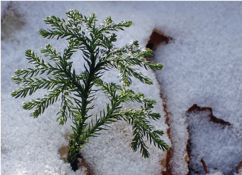
Prickly Tree Clubmoss ( Dendrolycopodium dendroideum ) is not a moss nor a tree, but is an evergreen plant that can be seen in our forests above a couple of inches of light snow. The plant, which can grow to a foot in height, is treelike in that each stem has many branches with needlelike leaves. You will usually see clubmosses in groups or colonies. Photo taken by Trix Niernberger in the Petersburg woods.