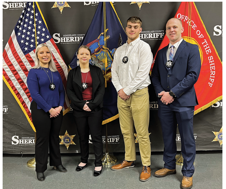
The new members of the Rensselaer County Sheriff's Department.