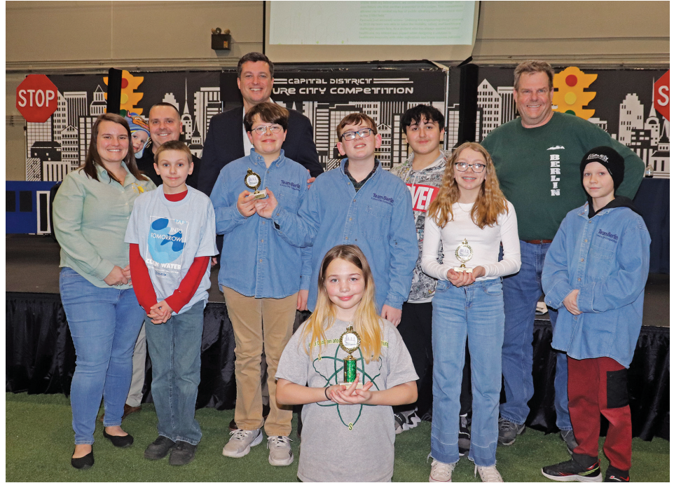
The Berlin Future City team, along with New York State Senator Jake Ashby, at the Capital District Regional Future City competition.

On Saturday, January 14, the Berlin Future City team came together for a great performance at the Capital District Regional Future City competition.