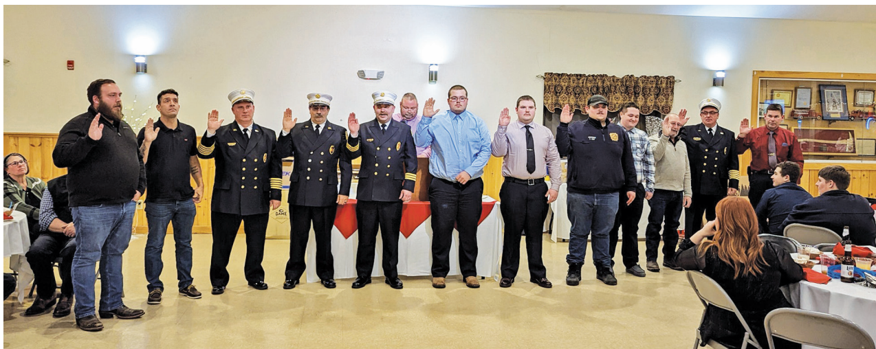
The Johnsonville Volunteer Fire, Rescue, and EMS Co.