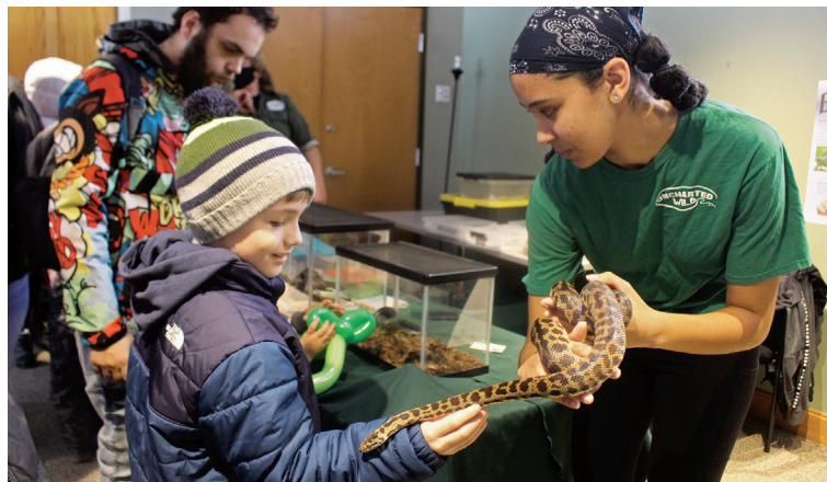
A young boy touching a snake held by a volunteer of Uncharted Wild inside the Welcome Center of Grafton Lakes State Park. Uncharted Wild was one of several indoor attractions at the 38th Annual Winterfest.

Grafton Lakes State Park is open year round. Like Grafton Lakes State Park on Facebook. Visit https://parks.ny.gov/parks/grafonlakes for more info.