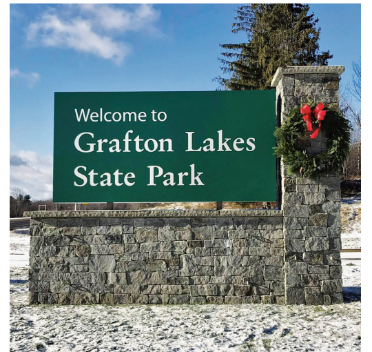
Grafton Lakes State Park, where the 38th annual ice fishing contest will be held on February 11.

Please use the park's main entrance. There is no entrance fee for this event. For more information, please call the park at 518-279-1155.