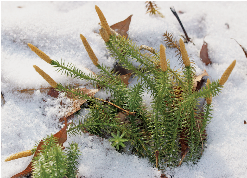
Interrupted Clubmoss ( Spinulum annotinum) grows in cold northern forests and currently appears to be categorized as the same species as Bristly Clubmoss reported here in earlier years. Whatever the common name of this plant, it is a pleasure seeing it standing in the snow on a winter day. This one was found in a colony of a hundred or more in the woods of Petersburg.