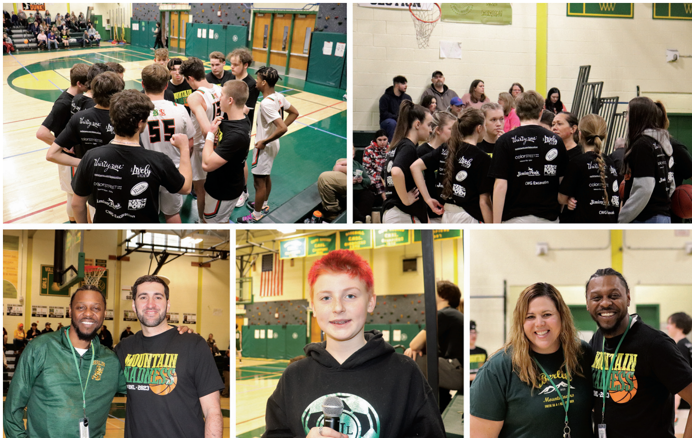
A collage of photos from Mountain Madness.