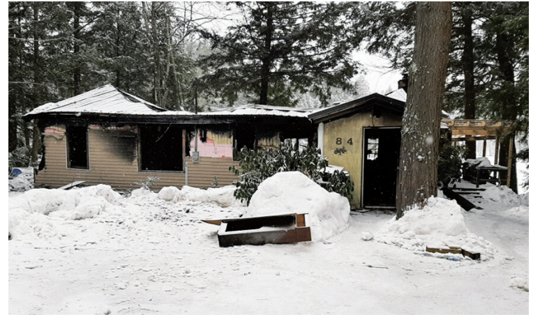
84 Lake Camp Way, where a structure fire broke out on the evening of January 30. Photo provided.

On Monday, January 30, at approximately 11:58 pm, the Grafton Rescue Squad along with the Grafton Highway Department, and the Petersburg, Hoosick, Center Brunswick, Eagle Mills, and Rensselaer County Fire Departments, responded to a structure fire at 84 Lake Camp Way, on Lake Elizabeth. Crews returned to the scene at approximately 9:47 am the following day when the fire rekindled. There were no injuries, and the building was a total loss. The cause of the fire is under investigation.